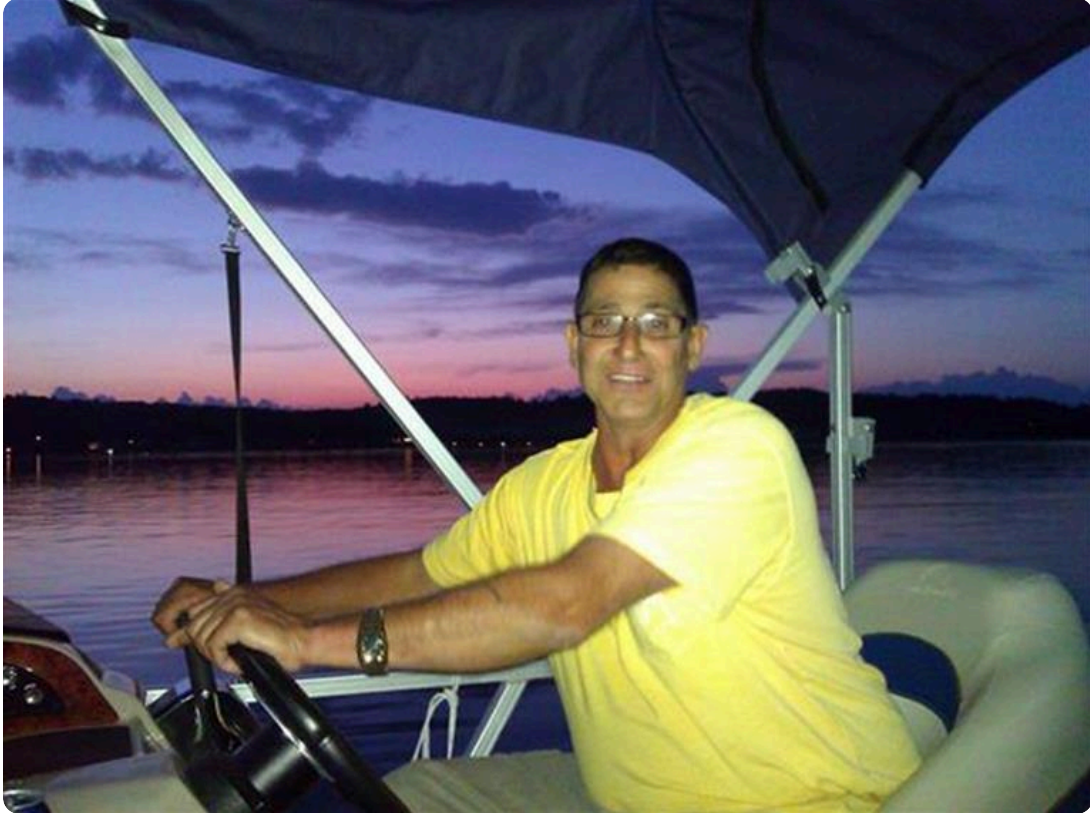
Forever in our hearts